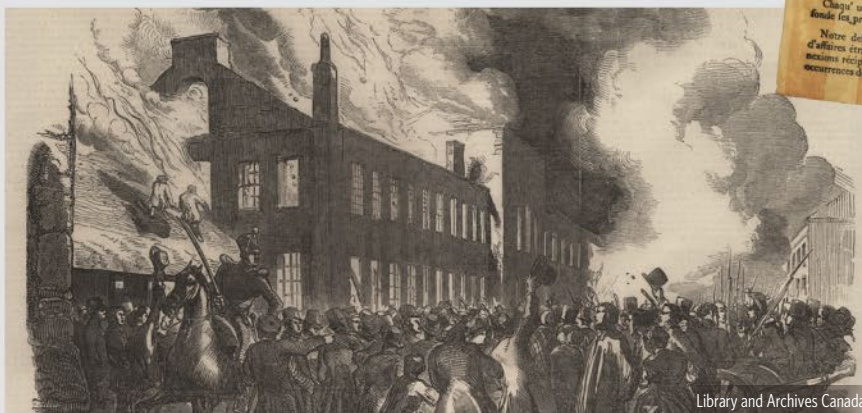
Library and Archives Canada

Published in 1558, Les singularitez de la France antarctique, avtrement nommée Amerique, & de plusieurs terres & isles decouvertes de nostre temps by André Thevet is the Library's oldest book.