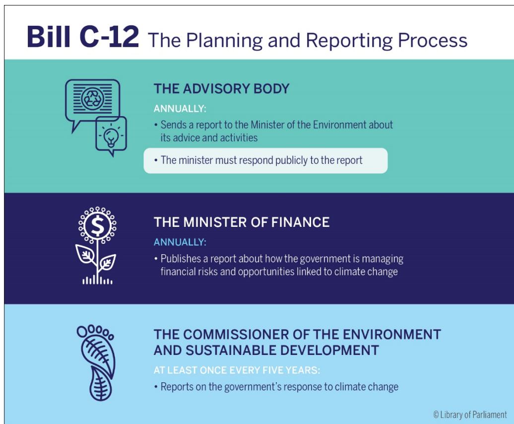
Figure 2 – Reporting Process Followed by the Advisory Body, the Minister of Finance and the Commissioner of the Environment and Sustainable Development